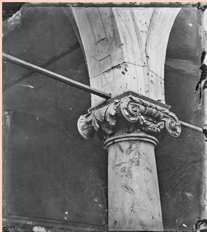
Josef Schulz, Column capital, the Belvedere in the Royal Garden of Prague Castle, 1865 collodion negative, digitally inverted, verso, 160 × 145 mm, IAH CAS